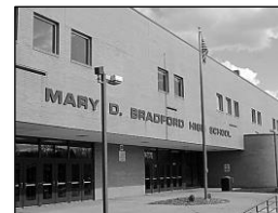
Mary D. Bradford High School Opened for the 1980-1981 school year