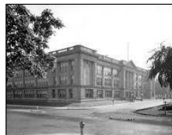
Kenosha Central High School, later renamed in honor of Mary D. Bradford Completed in 1927