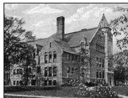
"The Annex" Built in 1890, razed in 1980