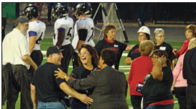
Alumni presentation of the first game ball at the first-ever football game at Mary D. Bradford Stadium. ALUMNI STRONG...BRADFORD PROUD!